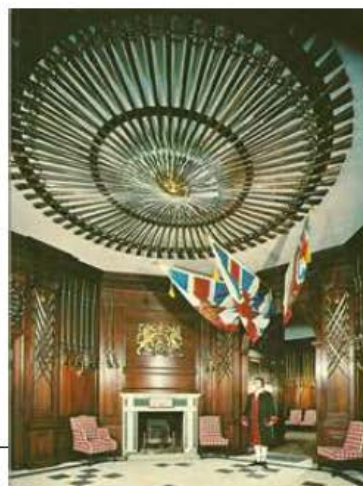
Williamsburg, Virginia, Governor's Palace

I'm a big fan of the classic – Greek – Roman – use of marble for intimately scaled entryways. Tricks of scale in the foyer often create an opening to a "big view" display. An open space that offers a view to a window or special feature of the home. It is a place to see favorite art or mementos; a sight defined by the occupants. Its common knowledge that 1 st impressions define you. Walking in; it should smell good: a vase with flowers is an ageless touch of elegance to dress up a bland entry. A plug-in air-refreshener near the front door is a classic bachelor plan B.