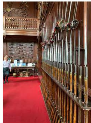
Brandenburg Castle, Scotland

Hoosier accent: "Foyer protection" -means - For your protection. A defined space for outdoor clothing. Often a place for keys, mail, shoes, things you don't want to forget, so you leave it by the door. Umbrellas, canes and baseball bats tend to be handy. If shoes come off, there is a bench to sit on. Always good to have a mirror at the entrance for a last self-check before you leave. The foyer is a popular connection point: a hallway to the closet, cloak room, mud room, stair landing and is your main egress point.