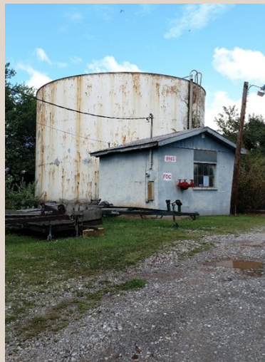
Above: Fire pump building and 10,000 gallon water storage tank

Gary Bergeron, CSI, CCS GSR Technical Chair