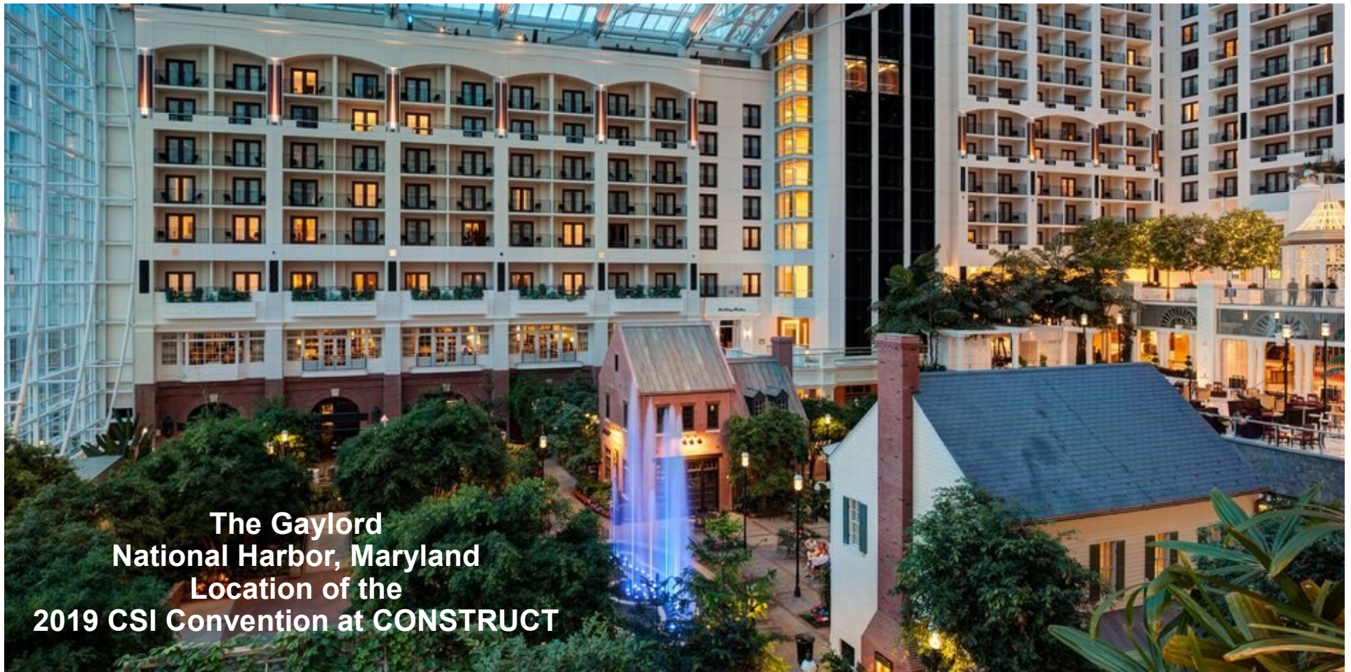
The Gaylord National Harbor, Maryland Location of the 2019 CSI Convention at CONSTRUCT

The Gulf States Region CSI includes Alabama • Arkansas • Florida Panhandle • Louisiana • Mississippi • Tennessee