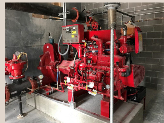
At Right: Fire pump https://hqi-fire.com/blog/annual-fire-pump-testing-a-few-important-tips