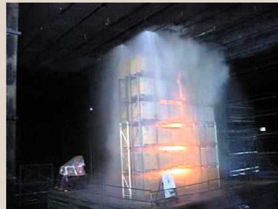
ESFR sprinkler system NFPA test click here to watch the test