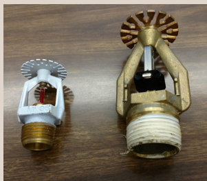
Standard sprinkler on left, ESFR on right

These snack type warehouses are often equipped with high storage racks that exceed 12 feet in height. According to the National Fire Protection Association (NFPA), this is considered high piled storage and commodity level XXX because of the high oil content and the cardboard carton storage system. These storage racks can be equipped with in-rack sprinklers, similar to what you see at Home Depot or Lowes, but this limits the reconfiguration of the storage system.