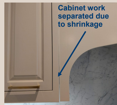
Cabinet work separated due to shrinkage