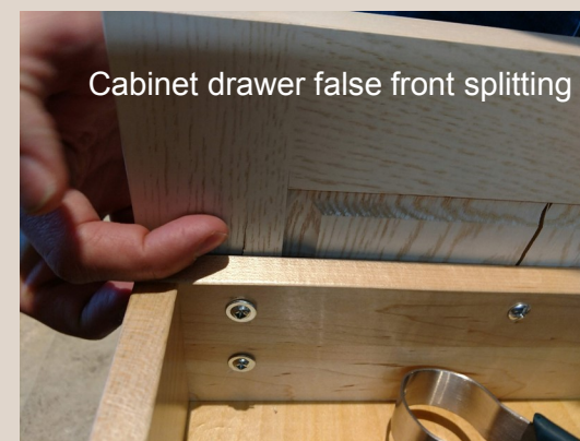
Cabinet drawer false front splitting