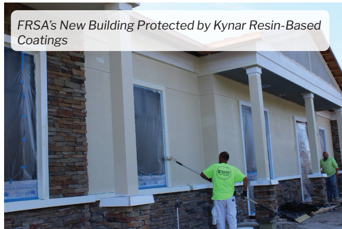
FRSA's New Building Protected by Kynar Resin-Based Coatings

coating-manufacturer have been tested and proven against “high performance” coatings in the category and have raised the bar for performance.