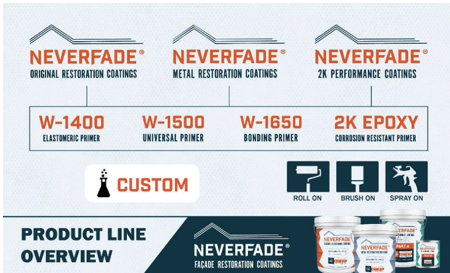
Figure 3: NEVERFADE Product Line Overview

against other high-performance coatings such as 100 percent acrylics, urethanes and FEVE-based coatings. After fifteen years of research and development, APV established the ultimate coating system that dramatically extends the lifecycle of buildings compared to other coating systems.