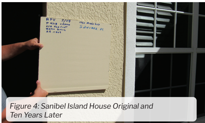
Figure 4: Sanibel Island House Original and Ten Years Later

APV's oldest project on the coast of Sanibel Island, Fla. in the Gulf of Mexico is a conventional stucco exterior that required constant maintenance by the homeowner due to dirt pick-up and mold growth. In July 2009, the stucco was power washed to remove contaminants, then primed with APV's W-1500 universal primer, and top coated with NeverFade Original formulation. When the house was painted, the contractor coated a small wood sample to be kept in the garage, away from the elements and used for later evaluation