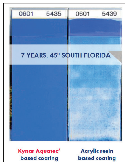
Figure 2: Seven-Year South Florida Film Thickness Comparison

Figure 2 demonstrates a Kynar Aquatec based coating's ability to resist film erosion after outdoor exposure. Both formulations shown utilize cobalt blue pigment, which is not affected by ultraviolet light and does not block UV from penetrating the coating surface. Therefore, any degradation of the coating from weathering is related to the resin binder system only. After seven years of South Florida 45-degree south exposure, the metal substrate is completely showing through the 100 percent premium acrylic-based coating, while the Kynar Aquatec based coating is still intact with minimal color fade and no film erosion. Protecting the substrate from weathering is one of the primary purposes of a coating. Since PVDF coatings maintain its original film thickness, the substrate is being protected for the long-haul against the elements.