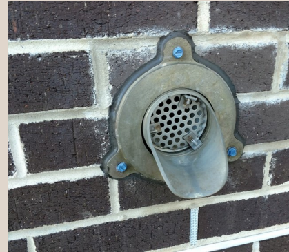
Secondary roof drain nozzle with hinged rodent/bird nest protection