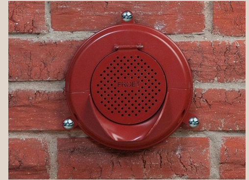
Secondary roof drain nozzle with "after market" rodent/bird nest protection