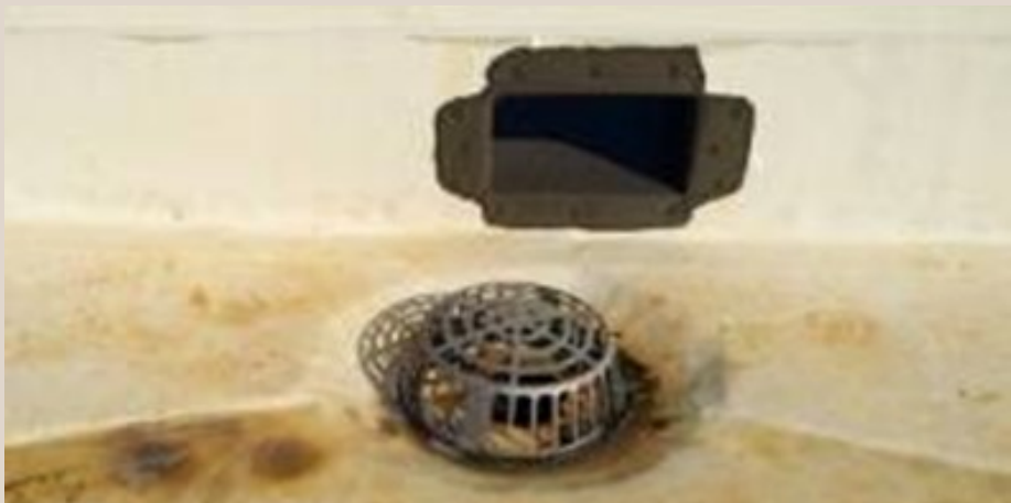
Roof drain & parapet wall scupper