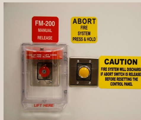
Clean agent manual release and abort switch