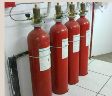
Clean agent gas cylinders