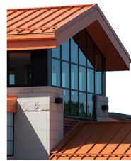
TITE-LOC PLUS METAL ROOFING SYSTEM Custom color: Marquis Orange

Latrobe Elementary School, Latrobe, PA | Installing Contractor: Pennsylvania Roofing Systems | Architect: Axis Architecture Distributor: Brock Associates | Owner: Greater Latrobe School District | Profiles: Tite-Loc Plus; PAC-750 Soffit | Color: Custom Marquis Orange