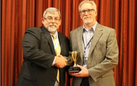
Chapter Cup for Most New Members-2017

not receive that award. That is truly a shame because they have done something very worthwhile for our organization in some fashion that deserves to be recognized. So do your due diligence in preparing the submittals for your deserving members. They deserve to be recognized. I will close by saying that the Region Awards Committee operates along the same guidelines as the Institute Awards Committee. If the Institute Committee receives an award submittal that is not complete or has not been prepared following the guidelines, then it is automatically disqualified. So PLEASE take the time to review the Award Guidelines, both Region and Institute, prior to preparing your submittals. Let's recognize those individuals who have gone above and beyond to make our organization better.