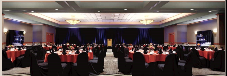
The Banquet room. Spacious and inviting.