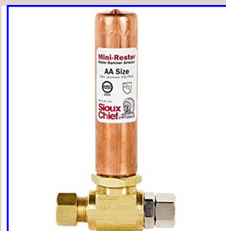
Above: Water hammer arrestor external view

The barber shop that I patronize had a water hammer problem that was difficult to resolve. Since a backflow preventer and pressure reducing valve had recently been installed, the plumber recommended a water expansion tank be installed on the cold water line serving the water heater. This expansion tank did not solve the water hammer problem because it is designed to provide for thermal expansion from hot water and does not act as a water hammer arrestor. The clothes washing machine was also a water hammer suspect because of its fast closing solenoid valve. The plumber recommended a shock stop to be installed on the washing machine box that contained the hot and cold water shut off valves for the washer. After this was installed, the water hammer still did not stop. Since the barber shop only had three barbers, each barber took one day off per week. When one of the barbers took his day off, the other two barbers were annoyed by the dripping faucet at the day-off barber's station. When the remaining barbers turned off the faucet at the fixture stop under the sink, all of the water hammer noise stopped. This tells us that sometimes a leaky faucet can be the culprit.