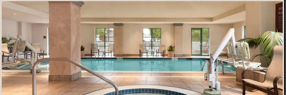
The swimming pool. What great light in this inviting atmosphere.