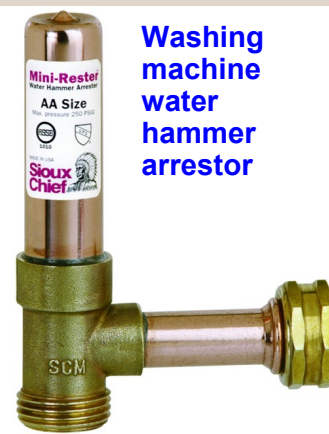
Washing machine water hammer arrestor

So, if you hear a water hammer noise at home, install a washing machine box or an icemaker water hammer arrestor available at your local big box retailer.