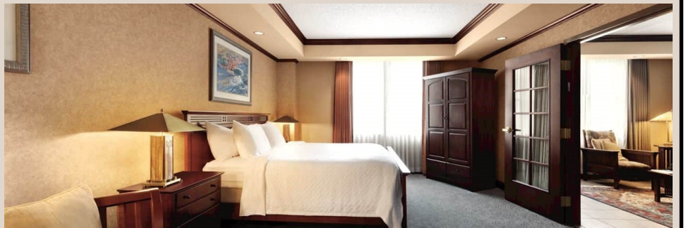
Guest rooms appear to be well appointed with lots of amenities. This looks like a lovely place to spend time relaxing and refreshing before and between meetings. Make your reservations well in advance to get the room you just right for you and your family.